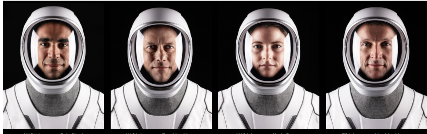
NASA Astronaut Raja Chari

On its flight to the International Space Station, Dragon will execute a series of burns that position the vehicle progressively closer to the space station before it executes final docking maneuvers, followed by pressurization of the vestibule, hatch opening, and crew ingress.